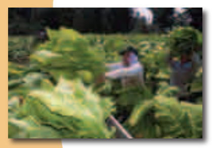
Anyone who works where there are infected mosquitoes is at risk of WNV infection.

groundskeepers and gardeners, painters, roofers, pavers, construction workers, laborers, mechanics, and other outdoor workers. Entomologists and other field workers are also at risk while conducting surveillance and other research outdoors. All outdoor workers should follow the recommendations in this brochure to reduce their potential for WNV exposure.