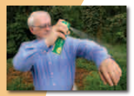
Using an effective insect repellent helps prevent mosquito bites.