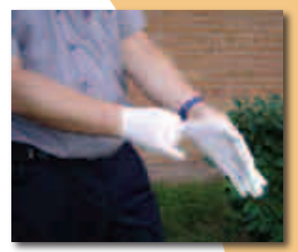
Wear gloves if you must handle dead animals.

Testing for WNV infection is available. No vaccine is currently available to prevent WNV infection in humans.