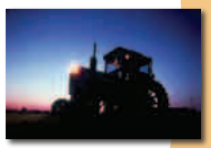
Many mosquitoes are most active from dusk to dawn.