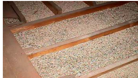
Vermiculite insulation between attic joists