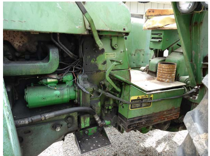
Photo 1. Driver side of tractor

The John Deere 3020 tractor had previously been driven into and parked in a pole barn. The tractor was usable, but in overall poor condition (tires, seat, controls, loose sheet metal, handles, etc.) (See Photos 1 and 2). The tractor starter wiring had been modified, including cutting the wire to the clutch safety switch, the cable that controlled shifting would not let the tractor be placed into neutral, and the emergency brakes were frozen.