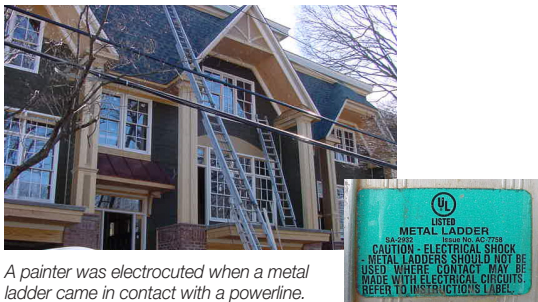
A painter was electrocuted when a metal ladder came in contact with a powerline.

Aluminum conducts electricity. A fiberglass ladder is a better choice when working near electricity.